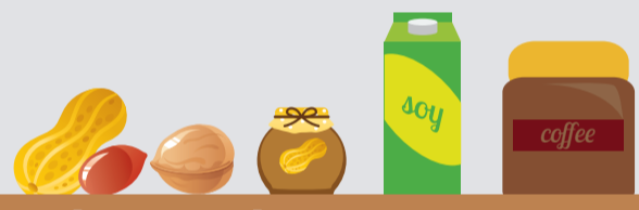
Dried Fruits and Legumes