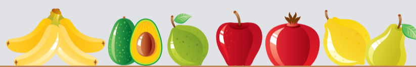
Fruits (Especially if Unripe)